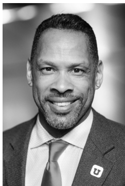
Harris Smith Chair

We strive to maximize the access, interest, and impact of theatre for our diverse audiences. Our productions will ignite exciting dialogue through talkbacks, panel discussions, and other artist-interface opportunities.